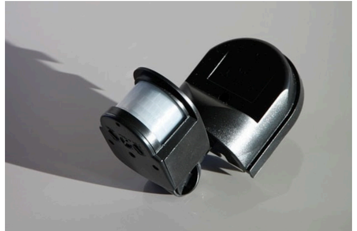
An infrared motion sensor you can use to secure both your home and office.

If you want to know more about motion sensors, do not hesitate to check out our motion sensor alarms guide .